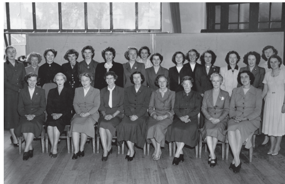
Below: Kindergarten graduates and staff, 1953.