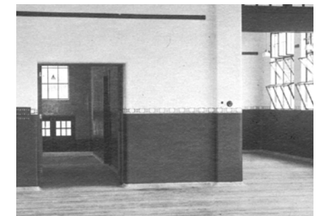
Right Rounded corners on walls and doors for extra safety.