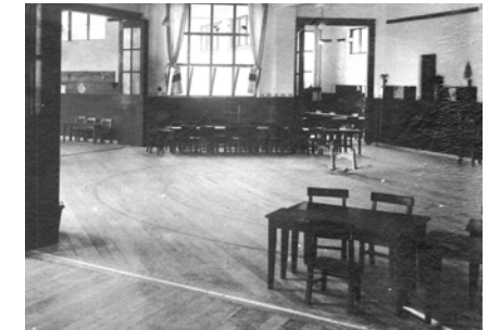
Top Circles on the floor of the main classroom symbolised unity and inner connection.