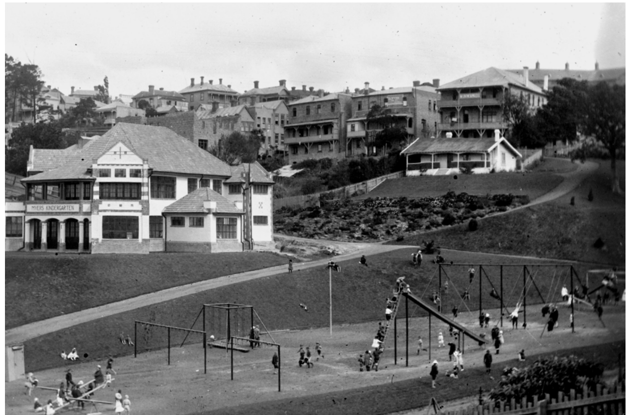
Right: The well-equipped children's playground.

'The world of little children – the [sic] nations in embryo – waited for Friedrich Froebel with his God-given insight, with his broad and deep and generous views of education as a whole, to set forth these principles and lay the foundation in the Kindergarten of these methods which have greatly reformed and are continuing to reform our schools... The Kindergarten stands for rational, wholesome development. It is the centre of sweetness and light – by its very name, translated from the German and meaning 'child garden' the child, like the plant, is placed in an atmosphere of mental and spiritual sunshine.' xiii