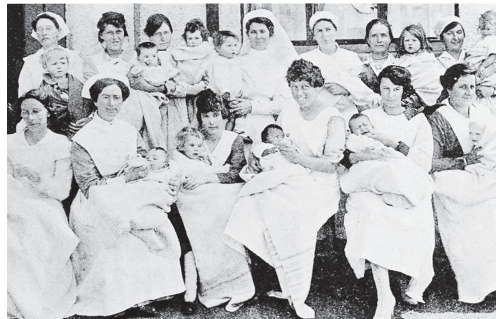
Above: Children affected by the influenza epidemic.

Myers Kindergarten opened as a temporary children’s hospital on November 11 under the supervision of Sister Broun, with a staff of volunteer kindergarten teachers and assistants. Infected children were bedded in cots and stretchers in the large circle room downstairs and in rooms upstairs. The circle room’s blackboards, normally used for children’s drawing, were now used to record