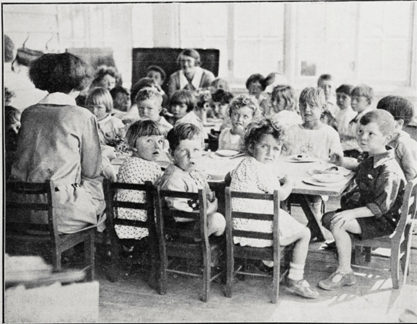
HAPPY LITTLE TOTS IN WELLINGTON'S FIRST PUBLIC KINDERGARTEN, RECENTLY OPENED AT BERGHAMPORE.