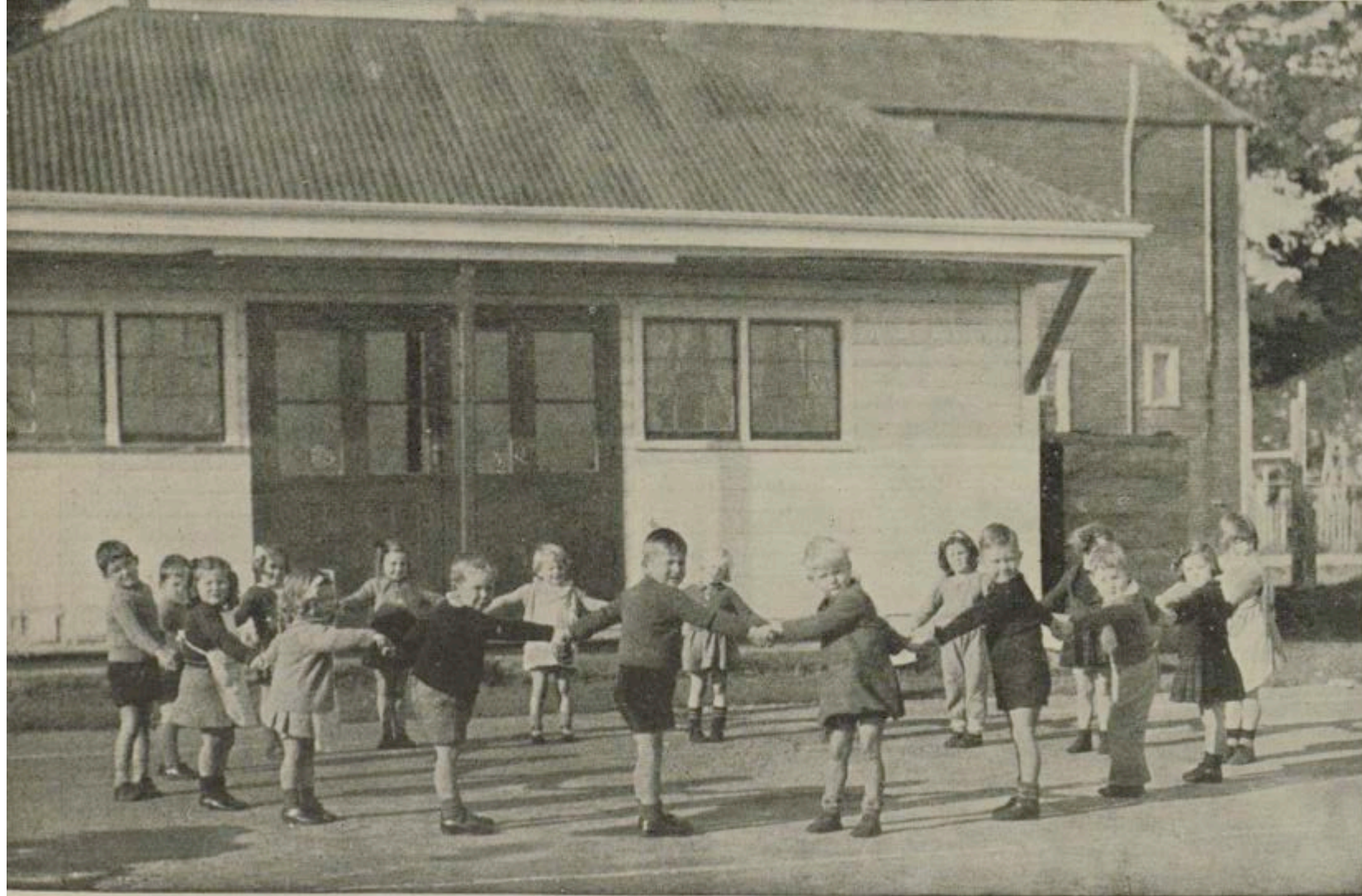
KINDERGARTEN SPONSORED BY AERO CLUB OPENED IN HOKITIKA