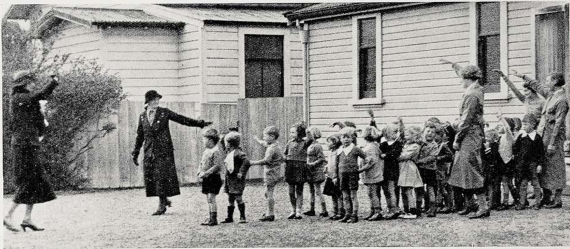
HASTINGS KINDERGARTEN CHILDREN RECEIVE A VICE-REGAL VISITOR