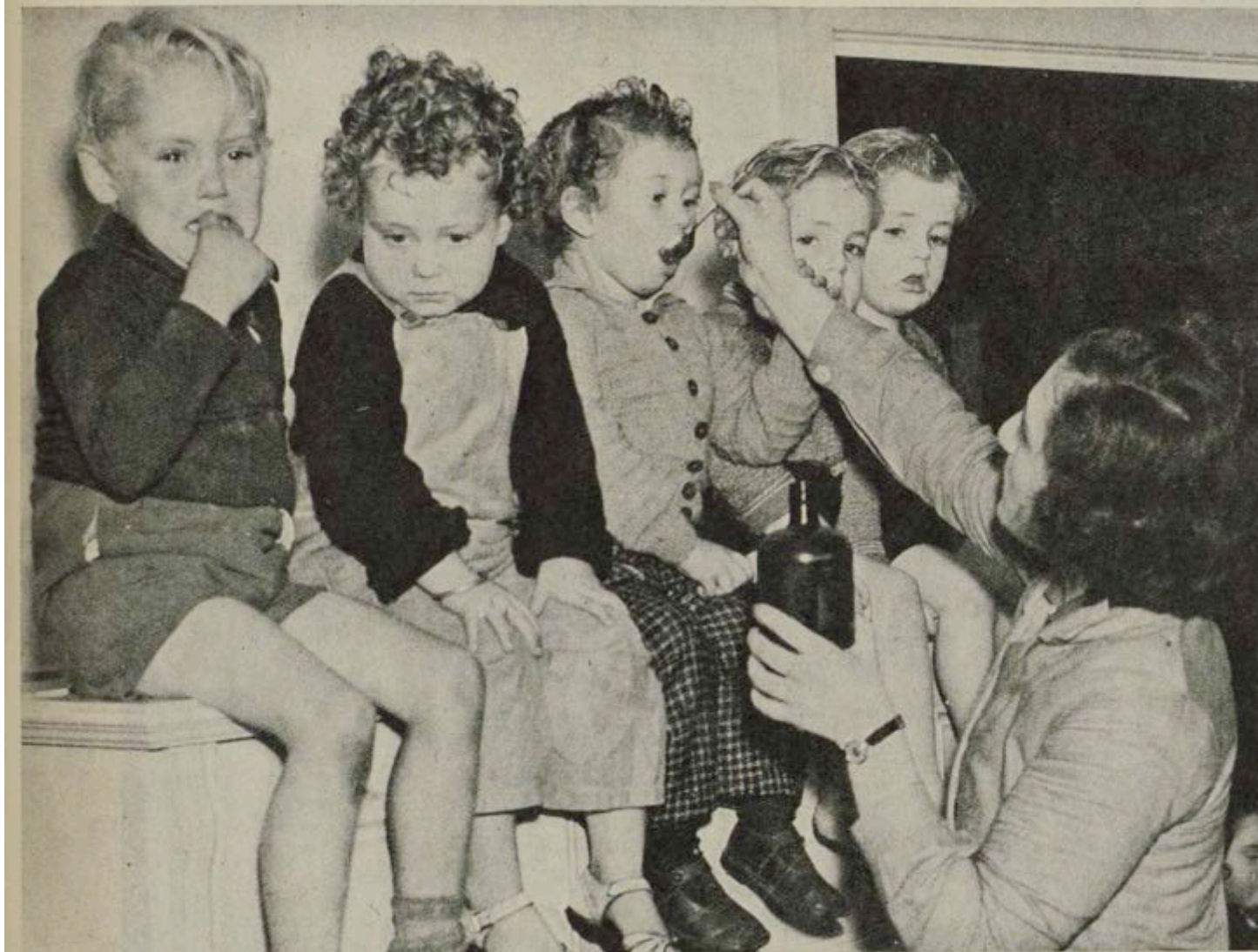
MEDICINE TIME IN THE KINDERGARTEN