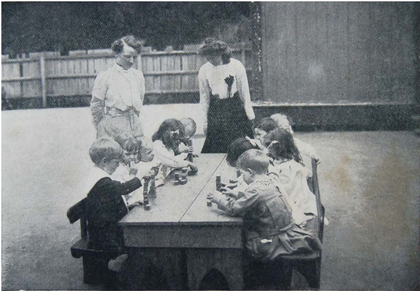
FREE-BUILDING IN THE YOUNGEST CLASS.

High Street School Kindergarten, Otago Witness 24 th December 1902