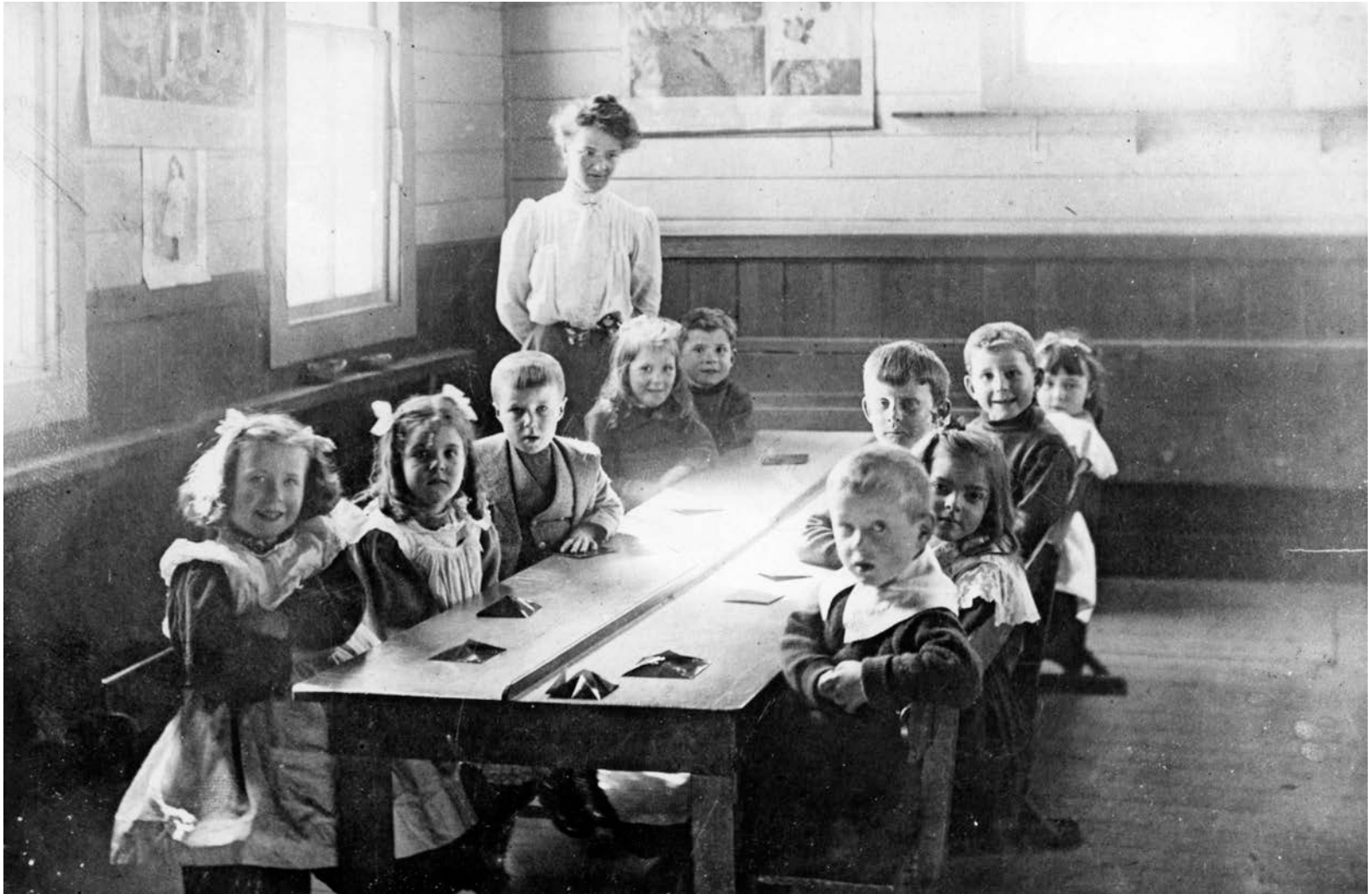
Froebelian 'occupation' of paper folding at High Street School Kindergarten, 1906, S10,164g