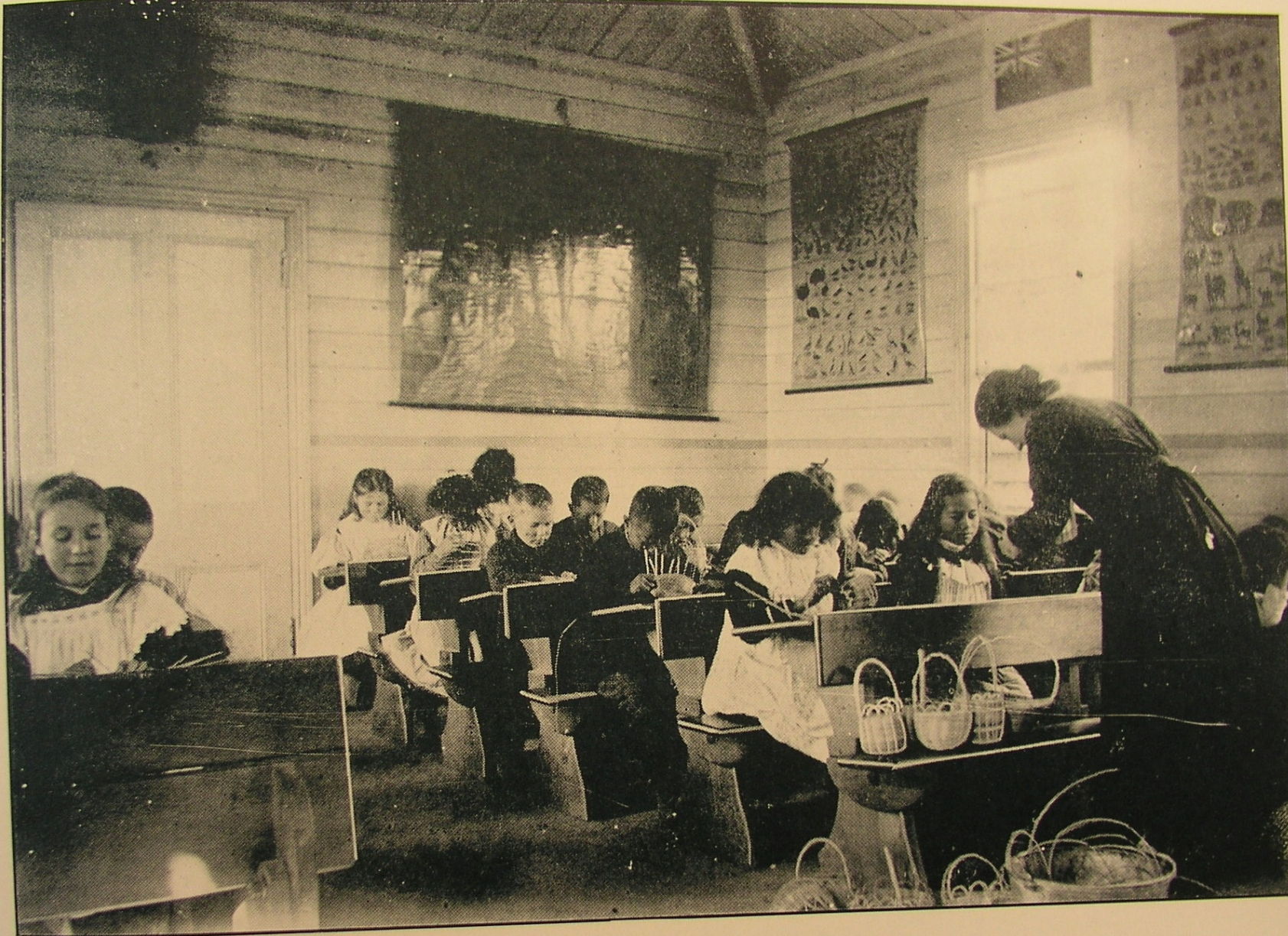
7. Basket-weaving—Waikouaiti, Otago.

Māori Children being taught to weave baskets at Waikouaiti School, Otago Appendices to the Journal of the House of Representatives, E1, 1902