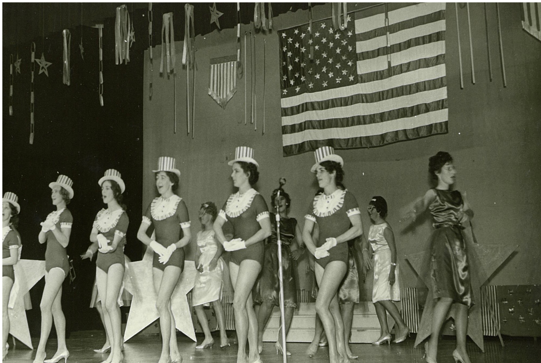
Westend Kindergarten 'American Theme' n.d.