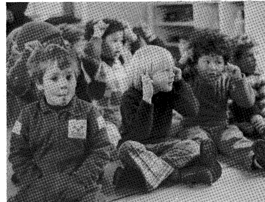
Simple Simon says...

The experience to be gained from the varying cultures is invaluable and the children become acquainted with the