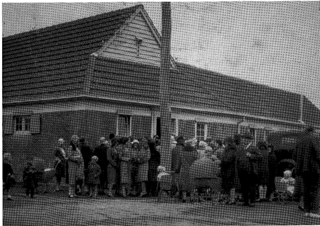
Dignitaries, parents and potential pupils about to inspect the kindergarten on opening day.

tightly closed until her Excellency undid it, opened into a large beamed hall full of tiny chairs and benches. Two other rooms of this, all with long French windows, provided a delightful setting for the children.