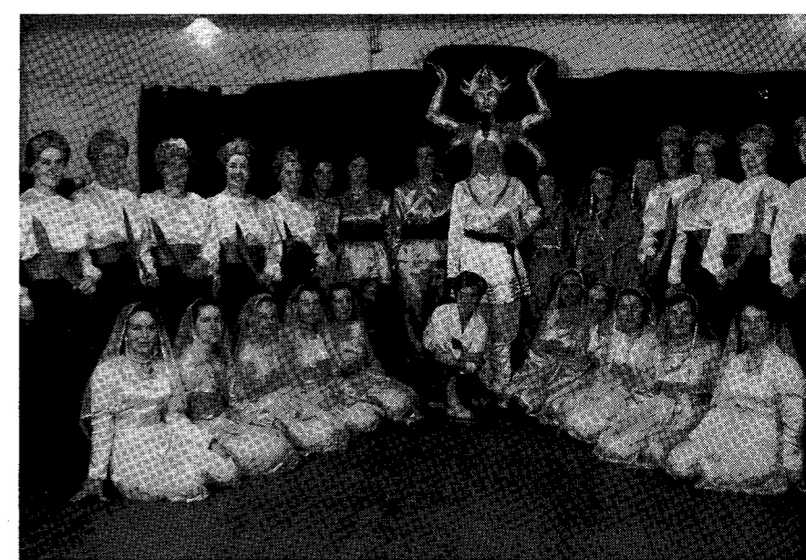
A talents evening, one of the many novel fundraising ideas undertaken by the Mothers' Club. This one, from 1960, was entitled "Salaam, Song of India".

From Mothers' Club executive minutes, 1946: "We also discussed ways of reviving the interest of past and present mothers who have not been attending club meetings. It was decided to hold a fathers' day one Saturday soon."