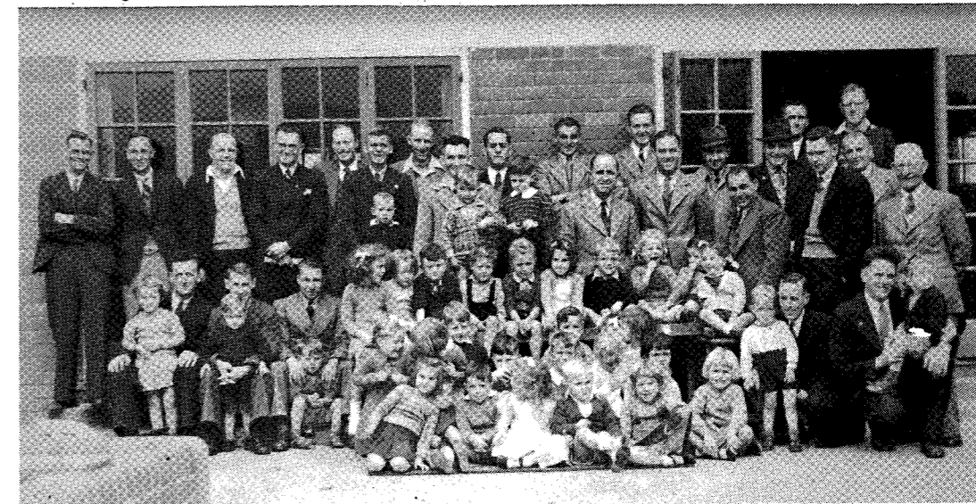
Children and fathers at the rear of the kindergarten in 1949.

In 1928 a child's birthday was "celebrated with a birthday cushion, a gift of a coloured handkerchief and special privileges. On a fifth birthday hundreds and thousands were sprinkled on their rusks."