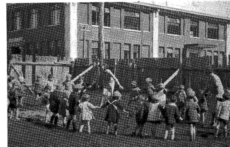
Playtime on the site before building commenced in 1930.

foundations stone being laid on July 16, by the Hon. Harry Atmore, Minister of Education.