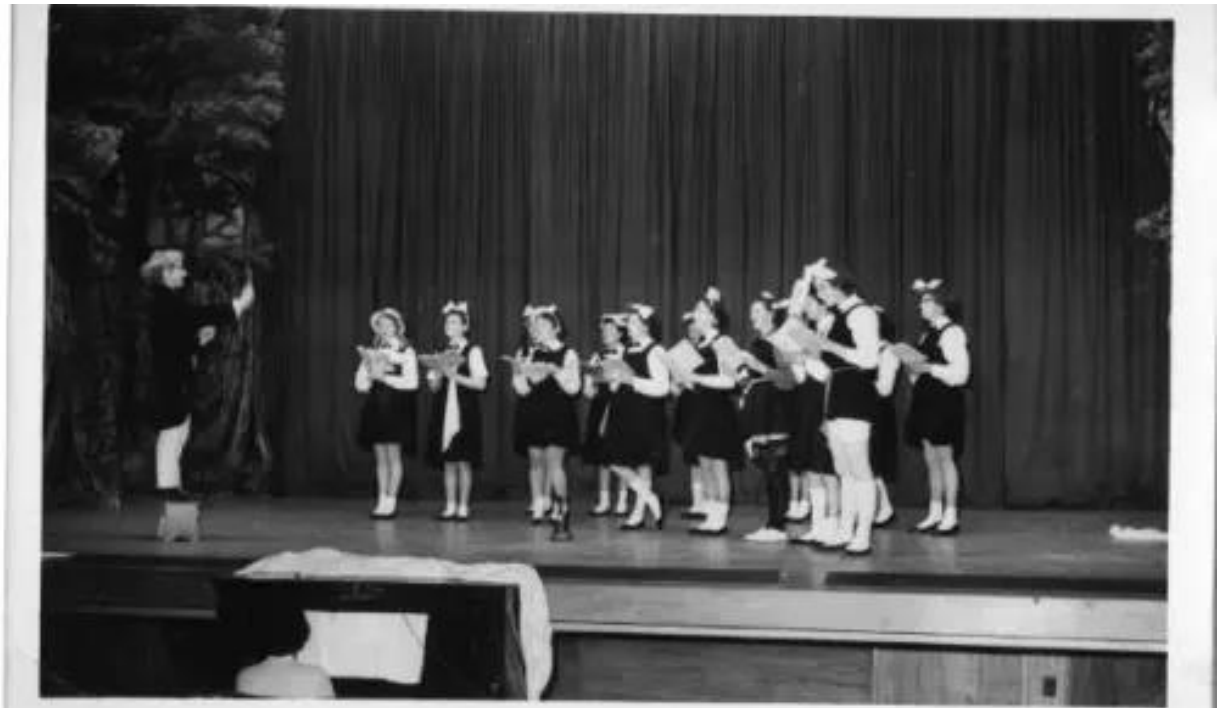
'The Belle's of St Roslyn' Roslyn Kindergarten Mothers Club 1960