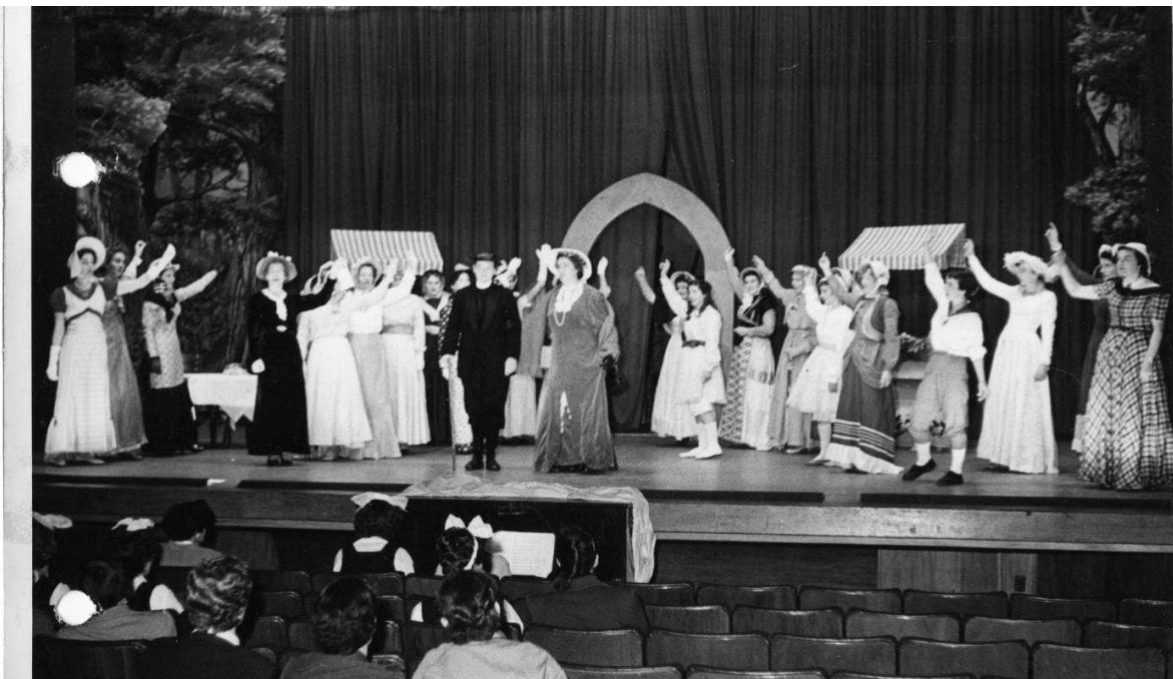
'At the village fair' Levin Kindergarten 1960