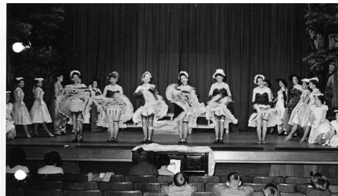
'The Cancana' Feilding Kindergarten Mothers Club in rehearsal 1960