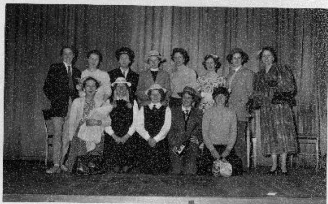
WEST END 1959