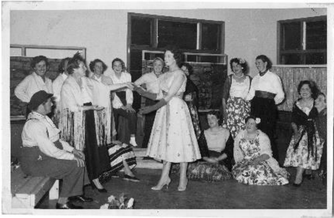
Italian Street scene, Dannevirke Kindergarten 1960